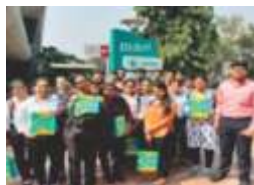
Local Industrial Visit to Bisleri Plant, Mumbai