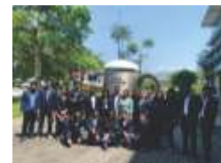
International Industrial Visit to Malaysia