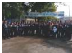
Domestic Industrial Visit to Shimla-Chandigarh