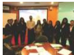
International Industrial Visit to Dubai

SBS regularly organizes various local, domestic and international industrial visits to sensitize students about the practical challenges faced by today's corporate world. It also helps students to become well-acquainted with current professional and business environments. These visits provide an opportunity to students to explore functional areas in different sectors like IT, Manufacturing and services, finance and marketing.