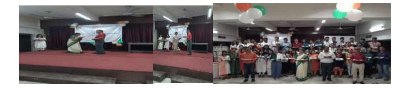
Independence Week –Cultural Day 17<sup>th</sup> August 2022